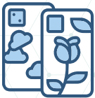
CASES & COVERS