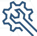
SPARE PARTS / CONNECTORS / PINS