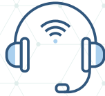
HEADPHONES / TWS